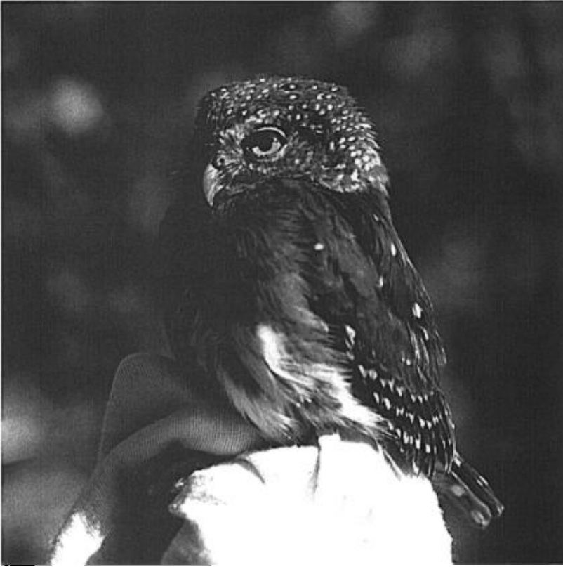
FIG. 1. Adult male Glaucidium nubicola from Alto de Pisones, Colombia (ICN 31200). Note the minimal or complete lack of pale spotting or barring on the back, sides of the chest, and flanks that distinguishes this species from the similar appearing G. costaricanum , G. jardinii , and G. bolivianum .

three additional specimens of the new South American taxon, all identified as nominate jardinii , in North American museums.